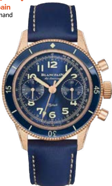
Blancpain Air Command