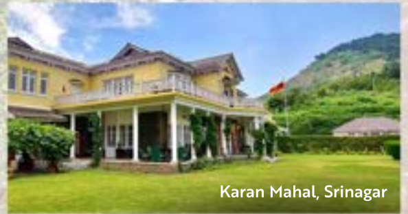
Karan Mahal, Srinagar