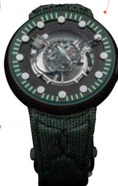
Boba Fett Kross studio bounty hunter, Star Wars