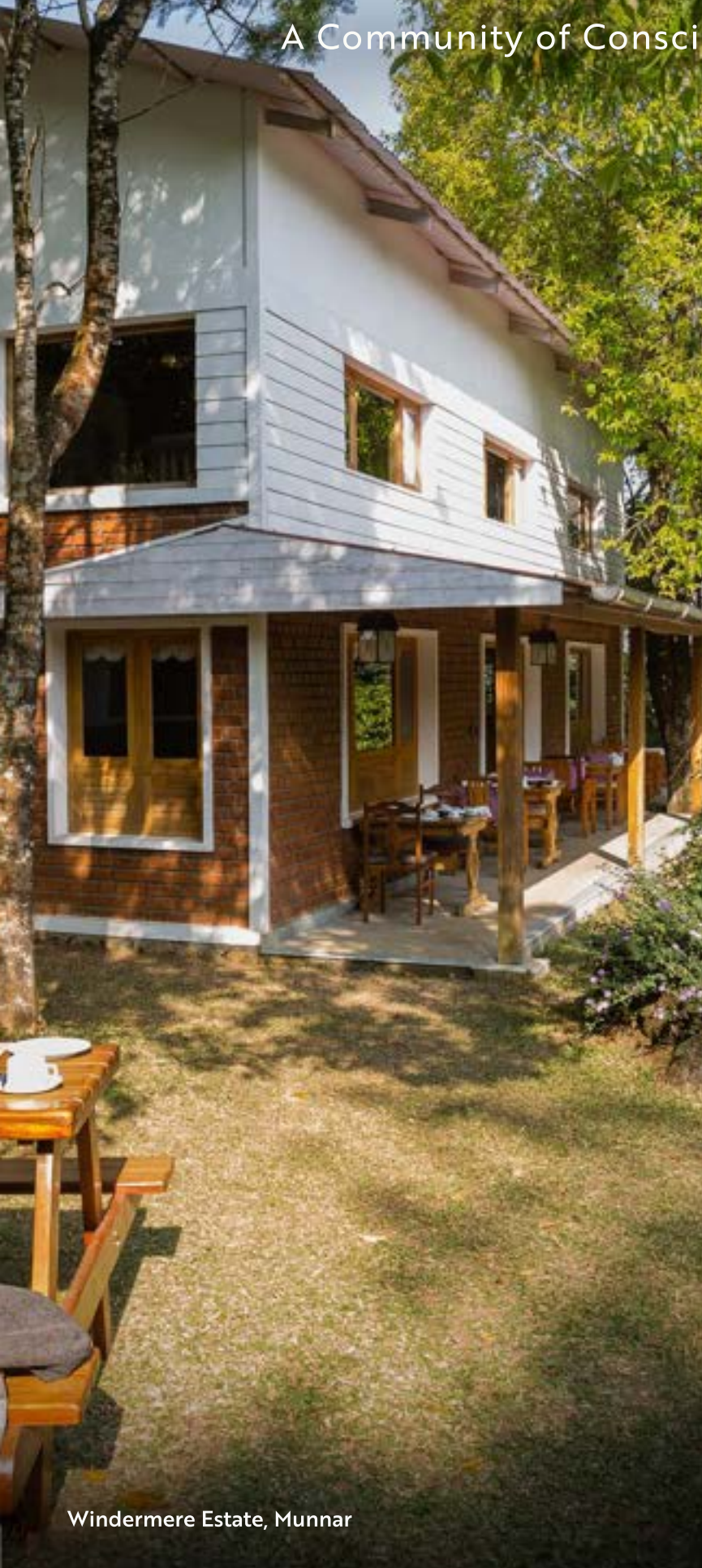
Windermere Estate, Munnar