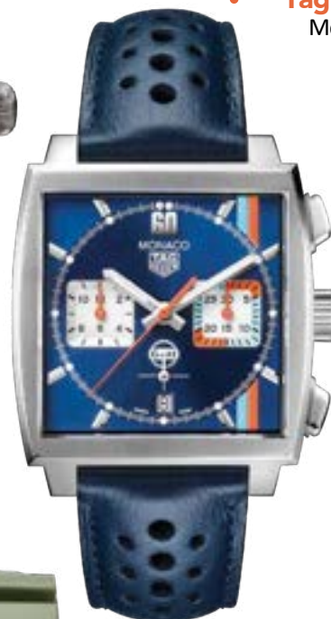
Tag Heuer Monaco