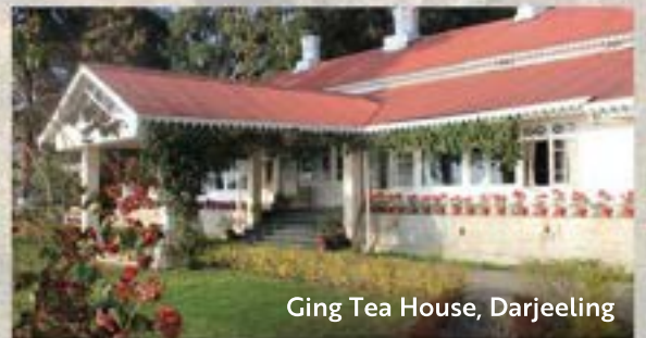
Ging Tea House, Darjeeling