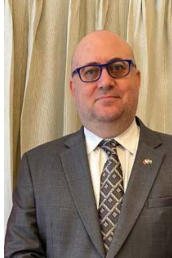
H.E.MR. REUBEN GAUCI HIGH COMMISSIONER OF MALTA TO INDIA

The Maltese Islands have three sites inscribed on the UNESCO World Heritage List. These are the City of Valletta, the Megalithic Temples and the Ħal Saflieni Hypogeum.