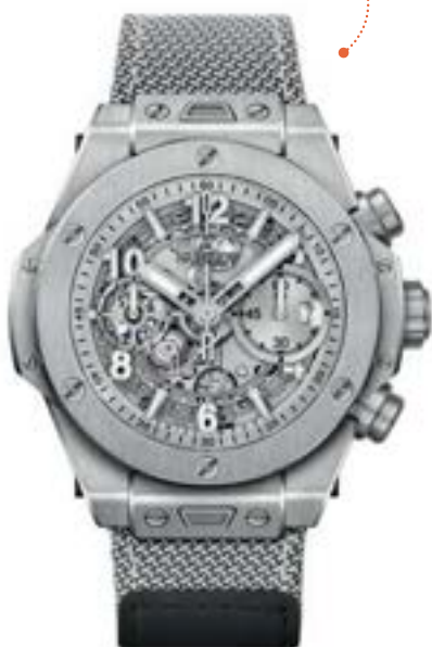
Hublot Big Bang Unico Essential Grey